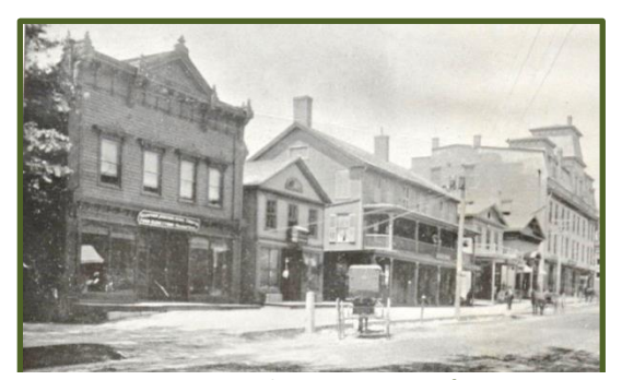
Main Street West Side, From: Views of Lee, 1895.

Have you ever walked along Railroad Street and wondered about the big grey and green clapboard Italianate building next to Dresser Hull's office building? It looks rather out of place, doesn't it? That's because it really is. You see, it used to be on Main Street. As buildings go, it was very mobile considering its size, and its history quite something to unravel, but let's have a go!