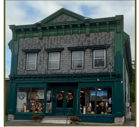
The Old Park Block on Railroad Street, 2023.

Now, here it gets interesting, because the original Park