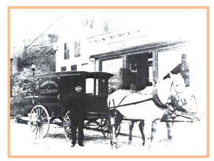
Devarennes General Store, East Lee, c.1920.