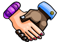
NATIONAL HANDSHAKE DAY