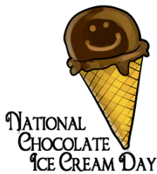
NATIONAL CHOCOLATE ICE CREAM DAY