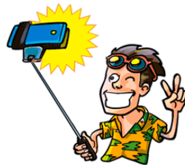
NATIONAL SELFIE DAY