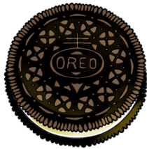
NATIONAL OREO DAY