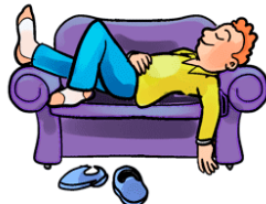
NATIONAL NAPPING DAY